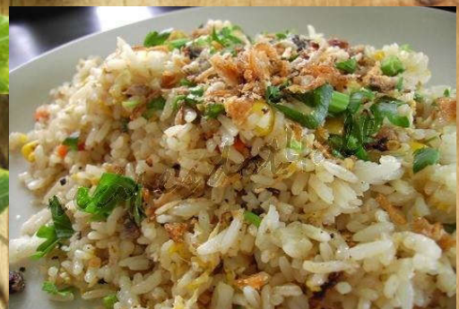
NASI GORENG IKAN MASIN RM10.50 NETT