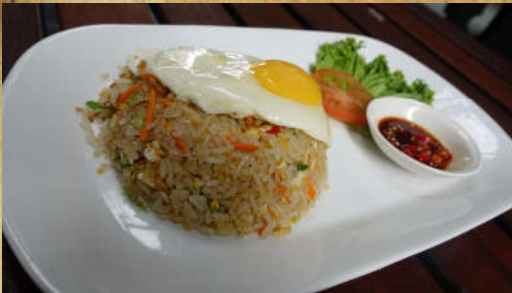
NASI GORENG TELUR MATA RM11.00 NETT