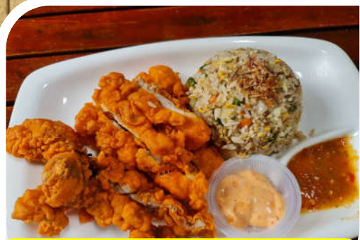
NASI GORENG CHICKEN CHOP [ORIGINAL/SPICY] RM18.50 NETT