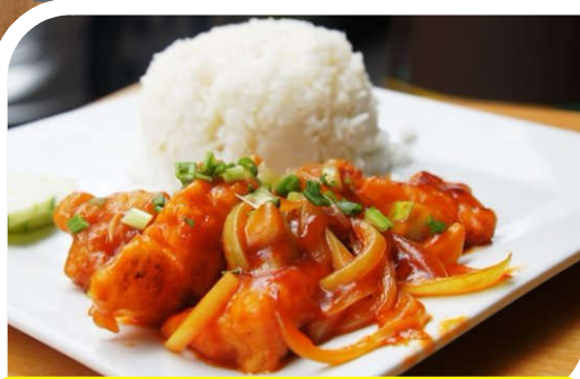
SWEET SOUR FISH FILLET (PERCH) RM13.00 NETT