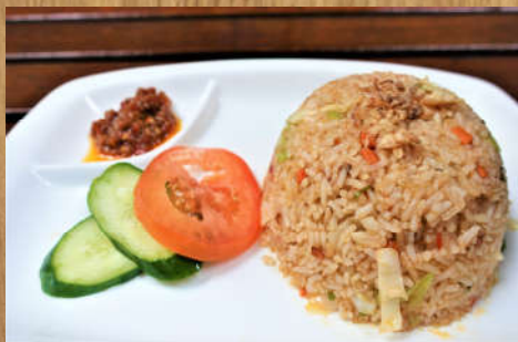
NASI GORENG TOMYAM RM10.50 NETT