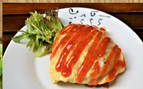
NASI GORENG PATTAYA RM10.50 NETT