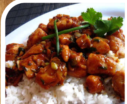
KUNG PAO CHICKEN RICE RM11.00 NETT