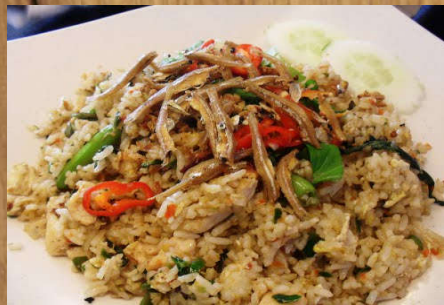
NASI GORENG KAMPUNG RM10.50 NETT