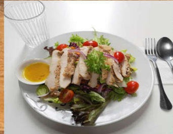
PAN SEARED CHICKEN BREAST SALAD @RM18.50