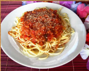
SPAGHETTI BOLOGNAISE CHICKEN @RM18.00