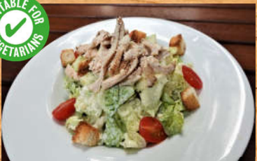
CAESAR SALAD @RM14.50 ADD CHIC BREAST @RM6.50