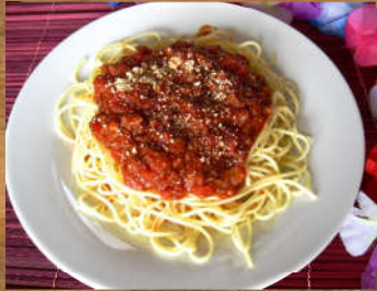
SPAGHETTI BOLOGNAISE BEEF @RM18.00