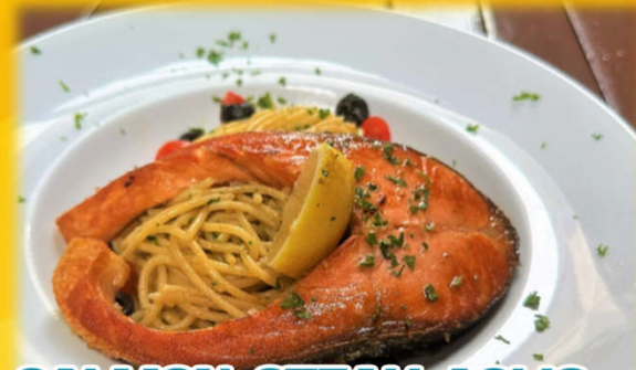
SALMON STEAK AGLIO OLIO RM29.50