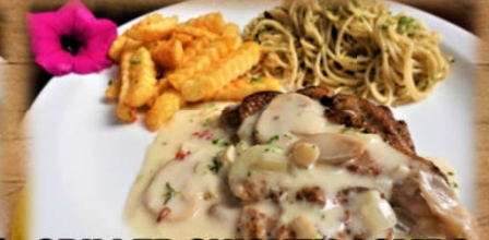
GRILLED CHICKEN COMBO