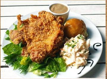
DEEP FRIED CHIC CHOP [ORIGINAL/SPICY] @RM18.50