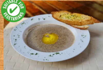
WILD MUSHROOM SOUP & GARLIC TOAST @RM14.00