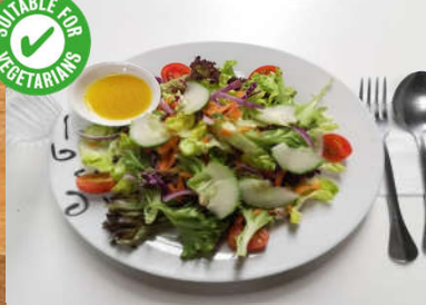
FRESH GARDEN SALAD @RM12.00