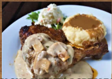
ALOHA CHICKEN & CREAMY MUSHROOM @RM19.00