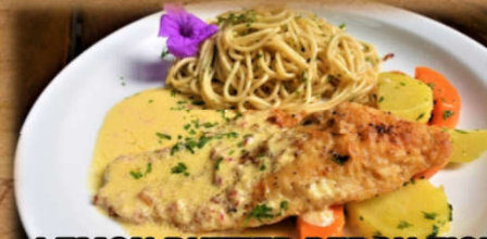
LEMON BUTTER PERCH FISH