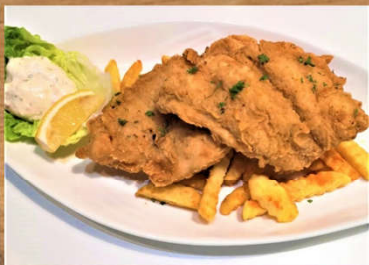
PERCH FISH & CHIPS [WITH HERBS] @RM19.50