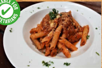
PENNE POMODORO @RM14.00