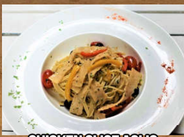
CHICKEN SLICE AGLIO OLIO @RM18.00