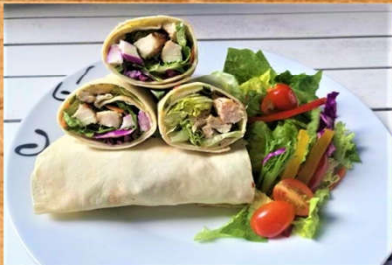
TORTILLA CHICKEN WRAP @RM17.00