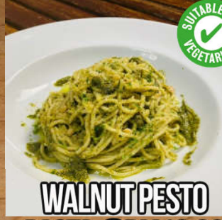
WALNUT PESTO PASTA @RM18.00