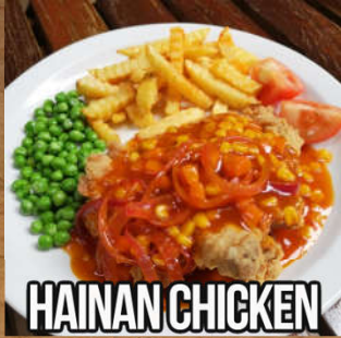
HAINAN CHICKEN CHOP @RM19.50