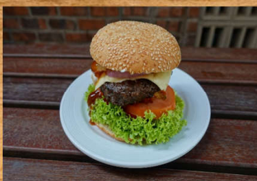
JUMBO BEEF BURGER & FRIES @RM19.00