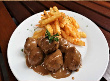
BEEF MEATBALLS & FRIES @RM16.00