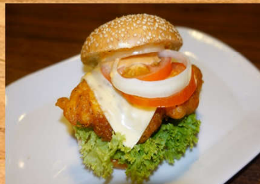
FISH FILLET BURGER & FRIES @RM18.00