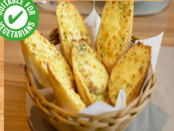
GARLIC BREAD @RM8.00