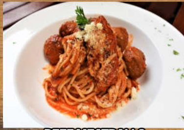
BEEF MEATBALLS SPAGHETTI @RM19.00