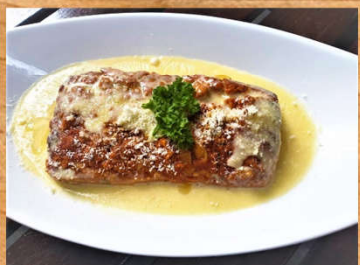
LASAGNA CHICKEN @RM19.50