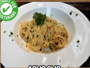
AGLIO OLIO OLIVE OIL @RM14.00