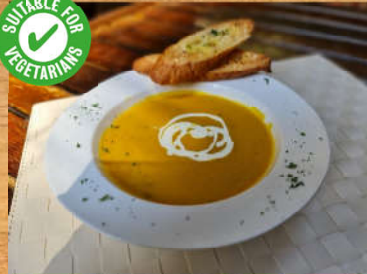
PUMPKIN SOUP & GARLIC TOAST @RM12.50