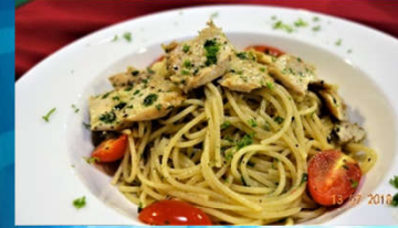
CHICKEN BREAST PASTA