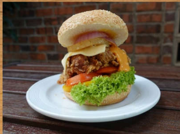
JUMBO CHIC CHOP BURGER & FRIES @RM19.00