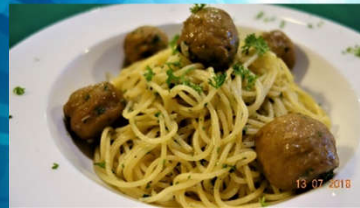
BEEF MEATBALL AGLIO